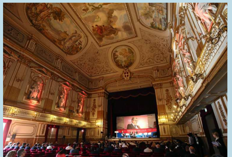
HALL OF FAME: The conference was held in the Court Theatre of the Royal Palace of Naples, designed by Ferdinando Fuga in 1768