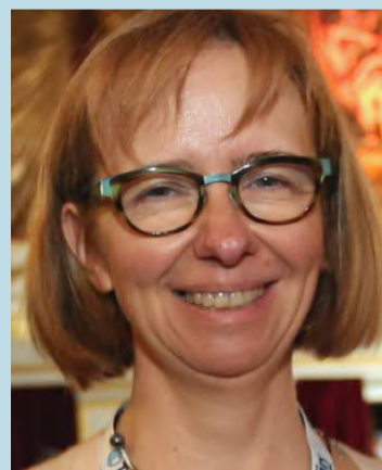
MAGDA KOPCZYNSKA: The European Commission's Director of waterborne transport